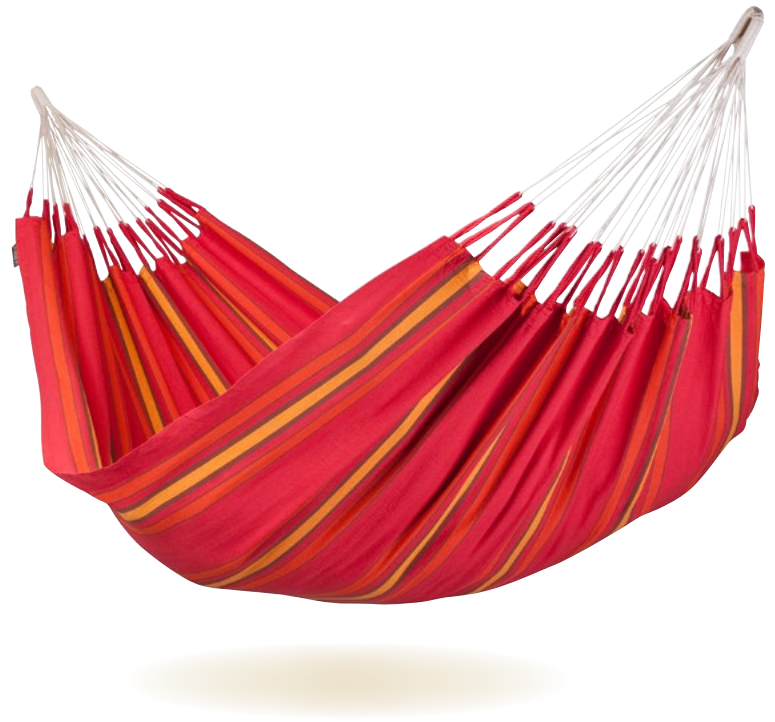
Double Hammock Currambera cherry CUH16-2